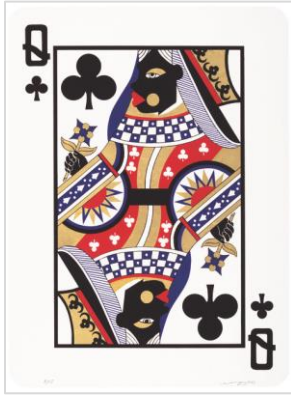
Derrick Adams, Game Changing (Queen) , 2015