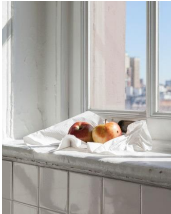
Bathroom Apples , 2015, Archival pigment print, 30" x 40"