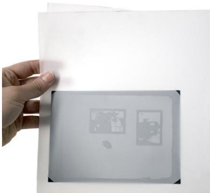
Held , 2016, Digitally composed image

Leah Mackin's exhibition Portable Document is composed of images, based on digital photographs, of historical material available online. Mackin responds to the digital surrogate of the scrapbook, examining the handling of and relationship with archival materials as physical objects. In this show, work from Mackin's ongoing investigation of materials, both physically and intellectually, include printed works on paper and sculpture that reflect on her interaction with the Historical Society of Pennsylvania (the institution that holds The Print Center's Archives).