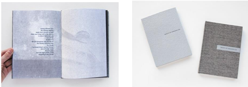
INSIDE 'OBJECTS OF UNKNOWN USE'