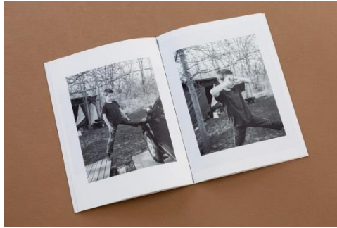
THE TIS02 SET, STACKED