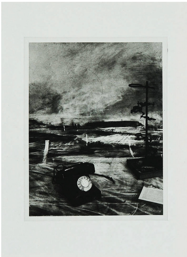
William Kentridge, plate from Receiver , 2006