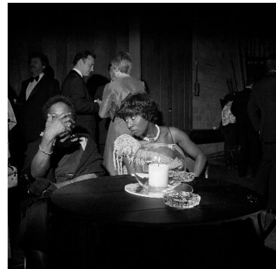
Untitled, 1980; Untitled, 1981; Untitled, 1981; from the series "Party Pictures"

NEW PUBLICATION FROM THE PRINT CENTER, PHILADELPHIA, PA