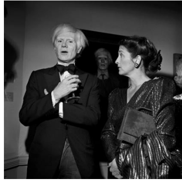
Untitled, 1987; Untitled, 1979; Untitled, 1980; from the series "Party Pictures"