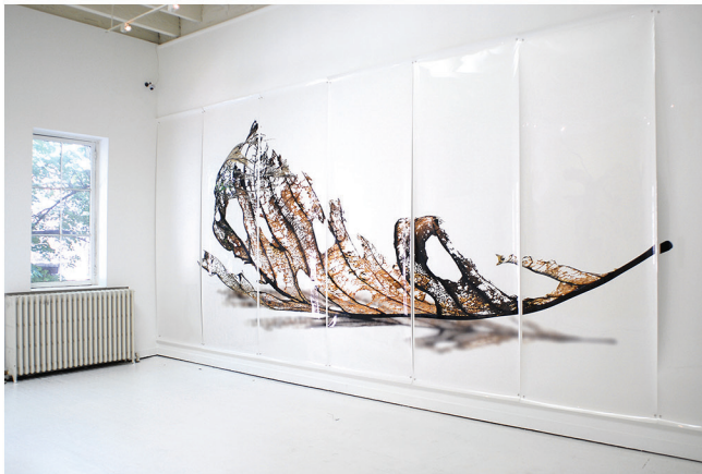
Black Pulse 7, Lambda by Doug + Mike Starn Installation view