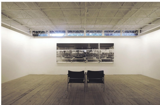
30th Street Station, Philadelphia, IV: April 20, 2006 by Vera Lutter for Taken with Time Installation view

In June 2006 and 2007 , The Print Center Gallery Store took part in the Affordable Art Fair in New York City. This opportunity brings broad exposure to The Print Center and our Gallery Store Artists and builds our reputation as a destination for the purchase of high quality, original art work.