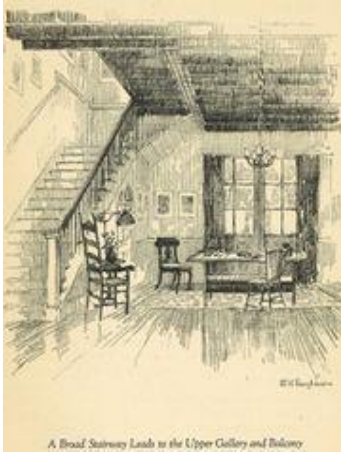
The Print Center of Philadelphia celebrates centennial

During the 1960s, photography also was brought under wing. Since then, the nonprofit organization has nurtured many artists from these "two incredibly powerful mediums," supporting the printed image in all its varied manifestations. Furthermore, it spawned both the Fabric Workshop and Brandywine Workshop; two Philadelphia-based but internationally acclaimed creative centers of printmaking activity.