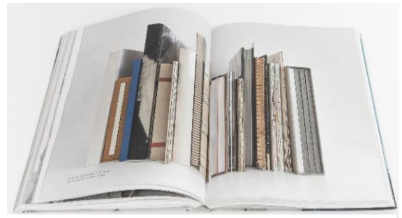
Publish Your Photography Book spread, 2023, courtesy of Radius Books. Photo: Brad Trone

In this richly illustrated “big picture” presentation, Swanson will explore the differences and similarities between seeking and securing a traditional publisher for your work vs. assuming all aspects of self-publishing your project. This presentation will cover the pros and cons of different approaches, advice on gaining knowledge surrounding production options and critical resources to help bring your book to its ideal audience.