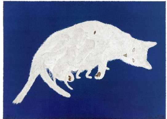
Kiki Smith, Litter (Fireplace Editions), 1999, 4 color lithograph with gilding, 22" x 30", edition of 50. Published by Universal Limited Art Editions

Spotlight on Kiki Smith will survey the ongoing collaboration with ULAE, beginning with her first lithograph produced at the studio in 1990 and concluding with a piece from 2020. The exhibition demonstrates how the continuous exchange between Smith and ULAE's master printers has encouraged one of the finest artists working in print today. Together, they have produced conceptually adventurous, technically ambitious and impressively large-scale prints. These works track along with Smith's shifting interests in the human body, self-portraiture, gender roles, nature and folklore. This is the first solo installation of Smith's work in Philadelphia since an exhibition at The Fabric Workshop and Museum in 2002-03.