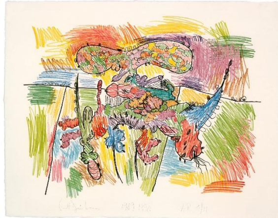
(left to right) Kiki Smith, My Blue Lake , 1995, 3 color lithograph and photogravure, 43 ½" x 54 ¾", edition of 41, © Kiki Smith / Universal Limited Art Editions; Carroll Dunham, Floating Shape with Backdrop , 1989-90, 4 color photolithograph, 22 ¾" x 28 ¾", edition of 47. © Carroll Dunham / Universal Limited Art Editions

PHILADELPHIA, PA – The Print Center is pleased to announce the exhibition ULAE: Prints for a New Generation , on view September 13 – November 23, 2024. The show will present printed works by nine leading contemporary American masters made at Universal Limited Art Editions (ULAE), the renowned printmaking studio in Bay Shore, New York: Carroll Dunham, Jane Hammond, Bill Jensen, Julian Lethbridge, Suzanne McClelland, Elizabeth Murray, Susan Rothenberg, Kiki Smith and Terry Winters . This show continues a longstanding series recognizing the work of printshops across the United States that have made extraordinary contributions to contemporary print, including the Brodsky Center, Dieu Donn e, Durham Press, Forth Estate and the Lower East Side Printshop. This exhibition is the first institutional show dedicated to the work of ULAE in Philadelphia.