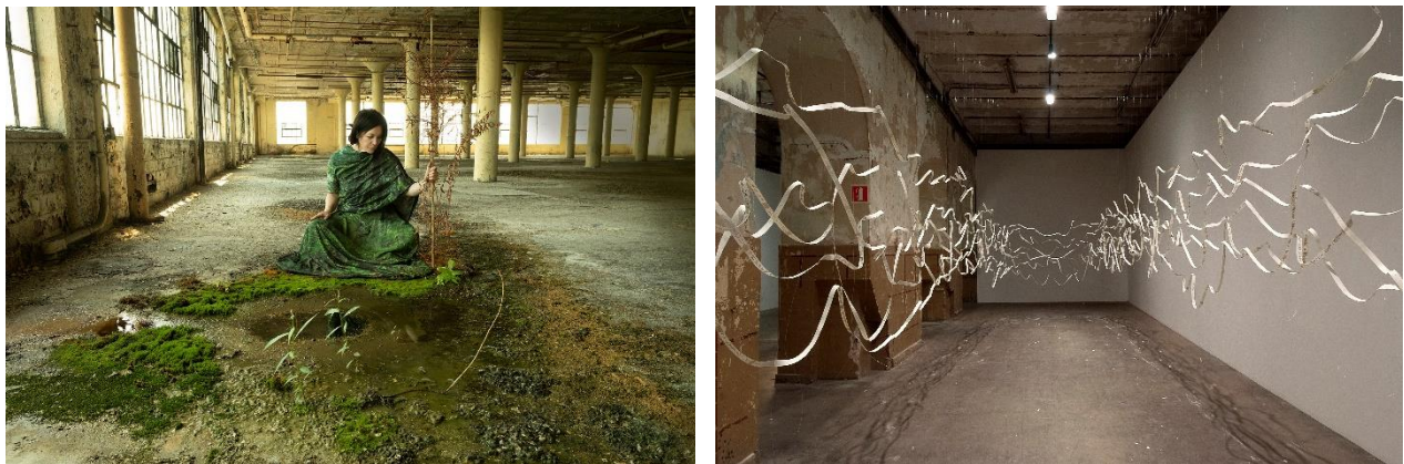
(left to right) Cecilia Paredes, The Encounter , 2020, inkjet print, 50" x 75"; installation view, Wishes in the Air , 2015, Tabacalera Art Promotion Space, Madrid, Spain

The first floor gallery will feature Paredes' series "Landscapes," which she describes as "photo-performances." In this series, her body is painted to be camouflaged against elaborately patterned, floral backgrounds – so immersed in her surroundings that the viewer can hardly tell where her body begins and ends. The preparation process can involve up to nine hours of meticulous painting as she carefully transforms her body to match the delicate petals and leaves of the chosen backdrop. In these photographs, the artist suggests the complexities of migration, in which an individual exists in a new place yet is still hidden from full recognition. The all-over patterning, use of symbolic textile design and performative self-portraits connect Paredes' practice to that of a number of female photographers using similar strategies to investigate identity, such as Patty Carroll, Lalla Essaydi, Rania Matar and Shirin Neshat.