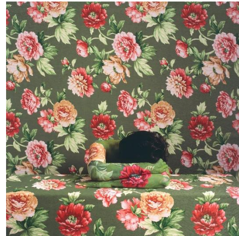
(left to right) Cecilia Paredes, Weaver with Plant , 2019, inkjet print on canvas, 58" x 87"; Dreaming Rose , 2009, inkjet print on Dibond, 47" x 47"

PHILADELPHIA, PA – The Print Center is pleased to present Cecilia Paredes: By my side or back of me , the Philadelphia debut for the Peruvian-born, internationally recognized artist. On view April 18 – July 19, 2025, the solo exhibition presents Paredes' exceptional performative photographic self-portraits as well as an immersive, site-specific, sculptural installation created from "wishes" contributed by visitors to The Print Center. Together, these works address the themes of migration and home, nature and the manmade, and the poetics of a collective voice. An opening reception for the exhibition and a gallery talk with Paredes will take place on Thursday, April 17, from 5:30 – 7:30pm.