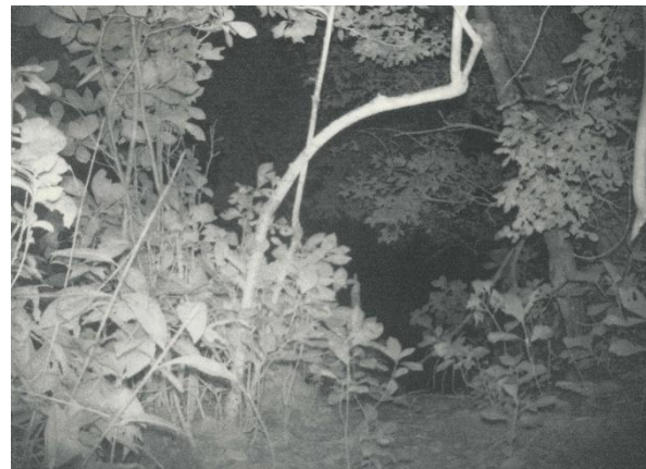
Glen Baldrige, Modus Tollens (Woodwose) , 2017, photogravure, 15 3/8" x 17 5/8".

For Glen Baldrige: The Pond , a body of water and the dense woods that surround it in rural Maine serve as the setting for his experimental prints. Featuring artworks produced over the past ten years, the project started while the artist was based in New York City and was forced to explore the woods from afar. Fascinated by its dynamics, he continues to make artworks “triggered by both unseen forces and wildlife” that spark his imagination. Together, the prints combine what seems to be the solitary, peaceful lives of animals with hallucinatory, sinister landscapes that signify fear of the unknown.