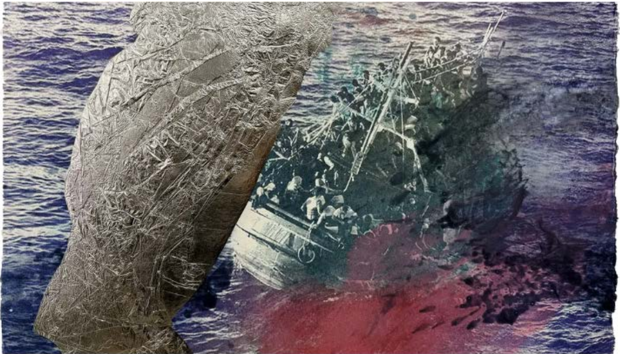
Nazanin Noroozi's 'False Dawn # 35', on view at The Print Center. (Image courtesy of The Print Center and the artist.)

Noroozi intentionally mars images, painting, scratching, tearing, and otherwise manipulating them, to convey not just how migration looks, but how it feels, transforming witnesses into participants. The fear is palpable in views of an overloaded rubber raft, of looking up to see a wave as tall as a building about to break, and of a far-off boat on the horizon, wondering if it sees your tiny vessel. With these, Noroozi intersperses sunsets, women dancing, a snorkeler slipping into calm water, and a woman on an ocean liner, gazing out at the Statue of Liberty.