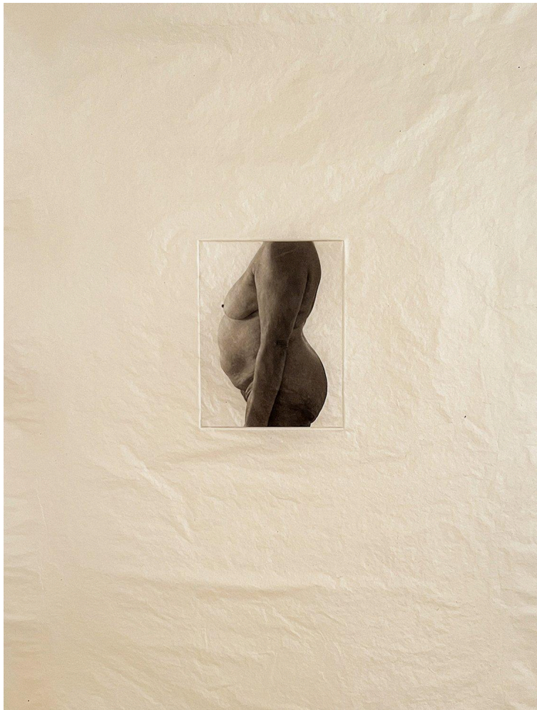
Nancy Hellebrand, Untitled KD 2691 , 2024, photogravure on Gampi, variable edition of 5, 25" x 19". Printed by Cindi Ettinger, C. R. Ettinger Studio.