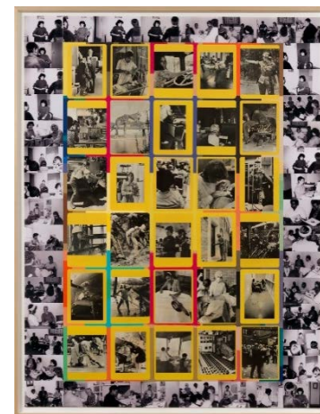
Carmen Winant, Being , 2018; Moon faces demons , 2022, sun-bleached construction paper, painter's tape, inkjet prints, 47 ½" x 36". Commissioned by The Print Center, Philadelphia. Photo: Jaime Alvarez; Women at Work (Job Cards) , 2022, sun-bleached construction paper, painter's tape, inkjet prints, 60 ¼" x 46". Commissioned by The Print Center, Philadelphia. Photo: Jaime Alvarez