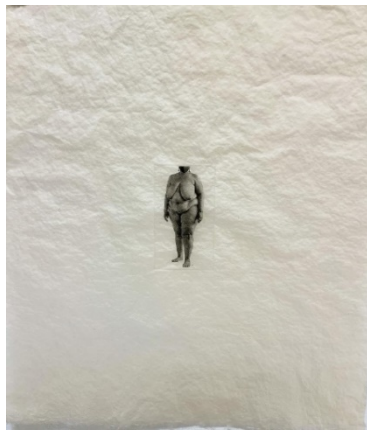
Nancy Hellebrand, Untitled , from the series, “NAKED,” 2022, photogravure, c. 24” x 36”

These exhibitions are organized in conjunction with (re)FOCUS, a Philadelphia citywide festival showing how women-identified and BIPOC artists have moved from the periphery to the center of the art world. (re)FOCUS celebrates the 50th anniversary of FOCUS, one of the first large-scale surveys of the work of contemporary American women artists signaling the inception of the American Feminist Art Movement, held in Philadelphia in 1974.