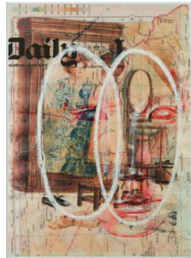
Mandy El-Sayegh, White Grounds (Fonds blancs) , installation view; Daily (double) , 2019, inkjet on canvas, 63” x 43 1/3”