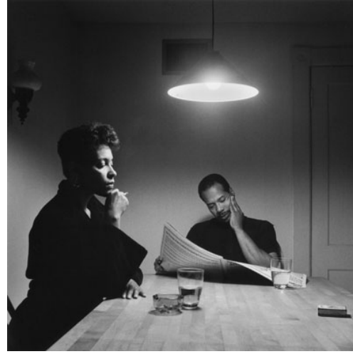
Carrie Mae Weems, The Apple of Adam's Eye , 1993, pigment and embroidery on sateen, Australian lacewood frame, 75" x 80"; Untitled , from "Kitchen Table" Series, printed 2003

At The Fabric Workshop & Museum, Weems created a textile-based, embellished self-portrait of sorts in the form of a 3-dimensional folding screen. In her "Kitchen Table Series," of staged photographs, Weems created imitation vernacular photographs by creating fictional snapshot-like images: "The kitchen, traditionally considered a female space, has rarely been pictured as a site of importance. Weems turns this idea on its head. She suggests the kitchen table is a stage where life's biggest moments play out, and where the full range of human emotions is expressed. The series compellingly examines women's lives. It boldly asserts, in particular, Black womanhood's complexity, strength, and beauty," (National Gallery of Art website, link above)