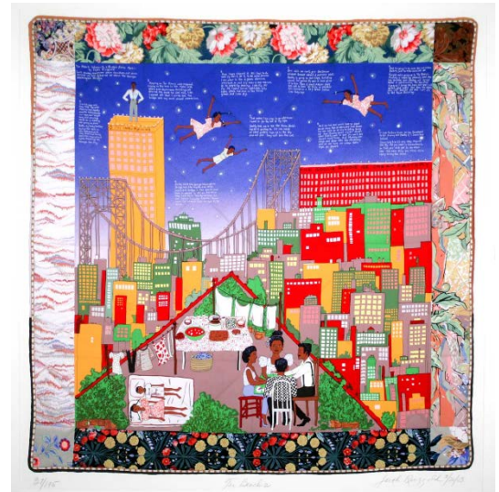
Faith Ringgold, Tar Beach , 1990, quilt