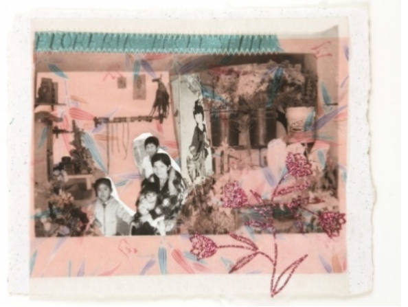
Martie Zelt, Florería (pink version) , 2009, photo-etching on handmade paper with chine collé and fabric, 9 ¾" x 9"